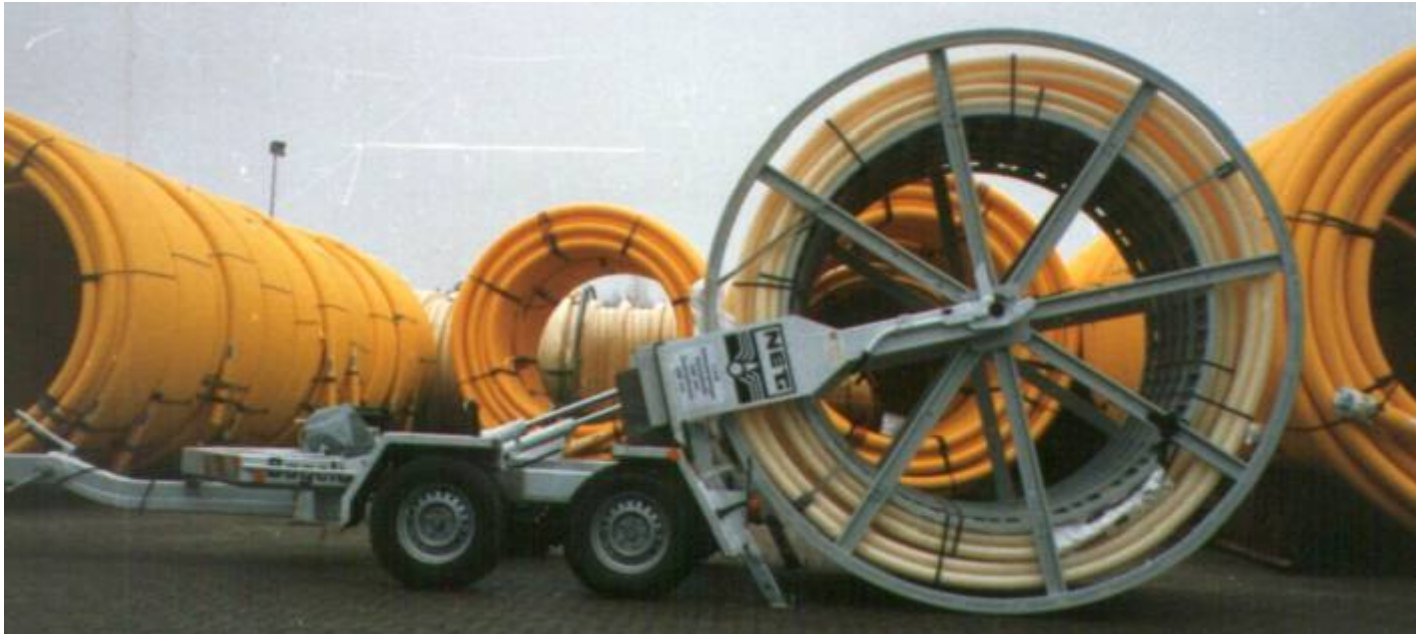
BRT 25 picking -up a U-liner drum