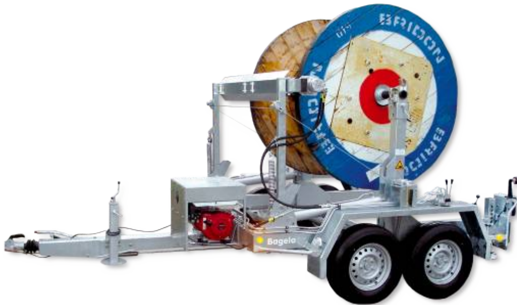
BKT 18, BKT 23 and BKT 27