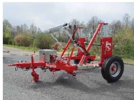
BTT 5825 / 7525 with extras (picture without mud guards and lightning system)

All trailers of the BTT series are available as a collapsible version, which reduces loading space and freight charges.