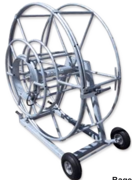
Bagela Coil Reel with standing rack

The Coil Reels type RH 40 and RH 63 may be used in a cable drum trailer, without the rack.