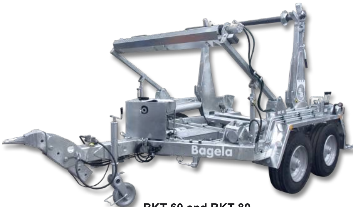
BKT 60 and BKT 80

Specifications are subject to change without notice. Output details are depending on use conditions.