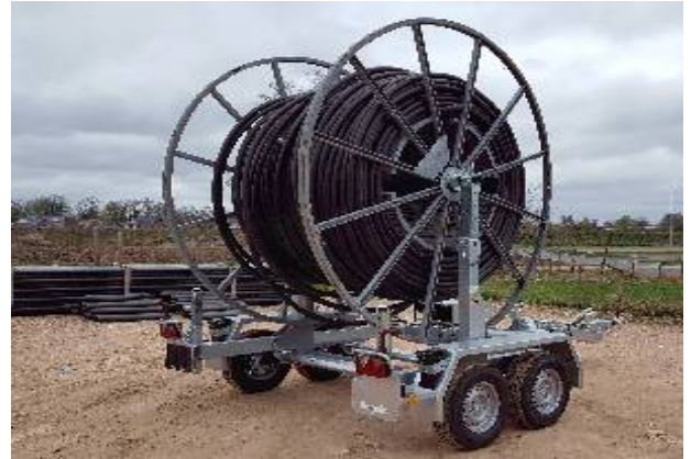
BKT 23/27 with HDPE-tubing drum