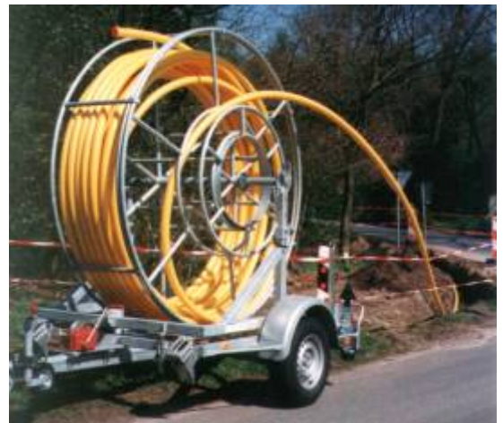
BKT 10 K with tube reel RH 63

The trailers of both construction series are hot galvanised.