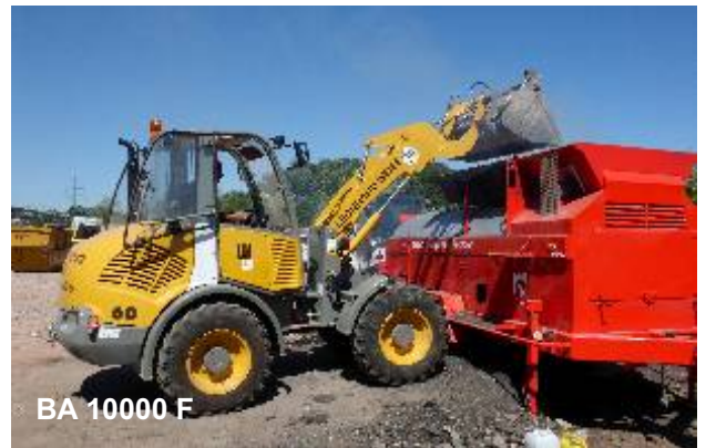
BA 10000 F

These high axial segments, fixed inside of the mixing drum, are preventing the premature escape of heat and ensure the absorption. The broken asphalt lumps warm up while passing the segments and reaching the heating section as small fines. In the heating section the material is heated up by radiant heat, but mainly by the hot wall of the mixing drum. After 10 minutes of heating the discharging gate is to be opened. Depending on the material and with continuous loading the output of the Asphaltrecycler BA 7000 F is up to 7t/h and the BA 10000 F up to 10t/h.