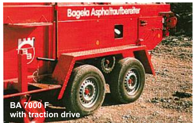
BA 7000 F with traction drive

Patent Application Publication Nov. 13, 2003 Sheet 1 of 2 US 2003/0211438